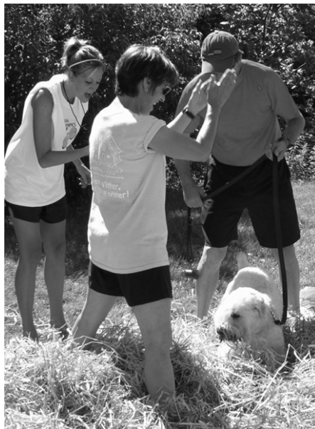
Stella doing her best at bone-finding

Three Dog Bakery Pet Angel Memorial Center Mallow Run Winery My Dirty Paws Animal Arts Academy Dog Dayz Playhouse and Retreat The Pet Company, Inc. For the Love of Dogs Bakery in Fishers