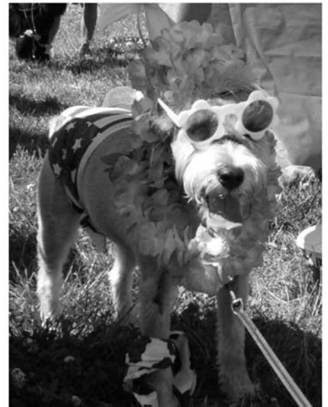
Duke, proud winner of the 3-minute makeover